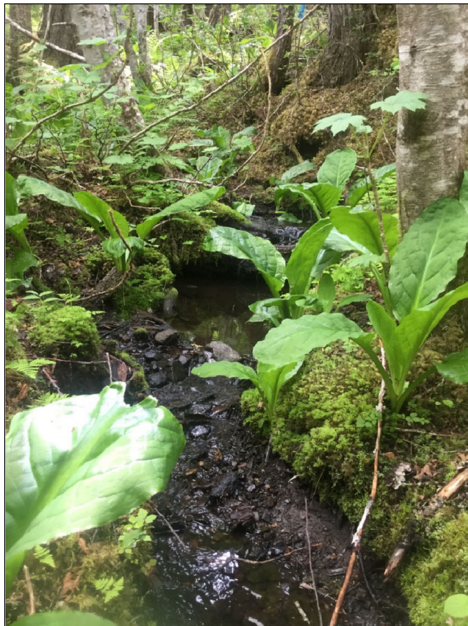
Figure 2.—Channel at waypoint 606.