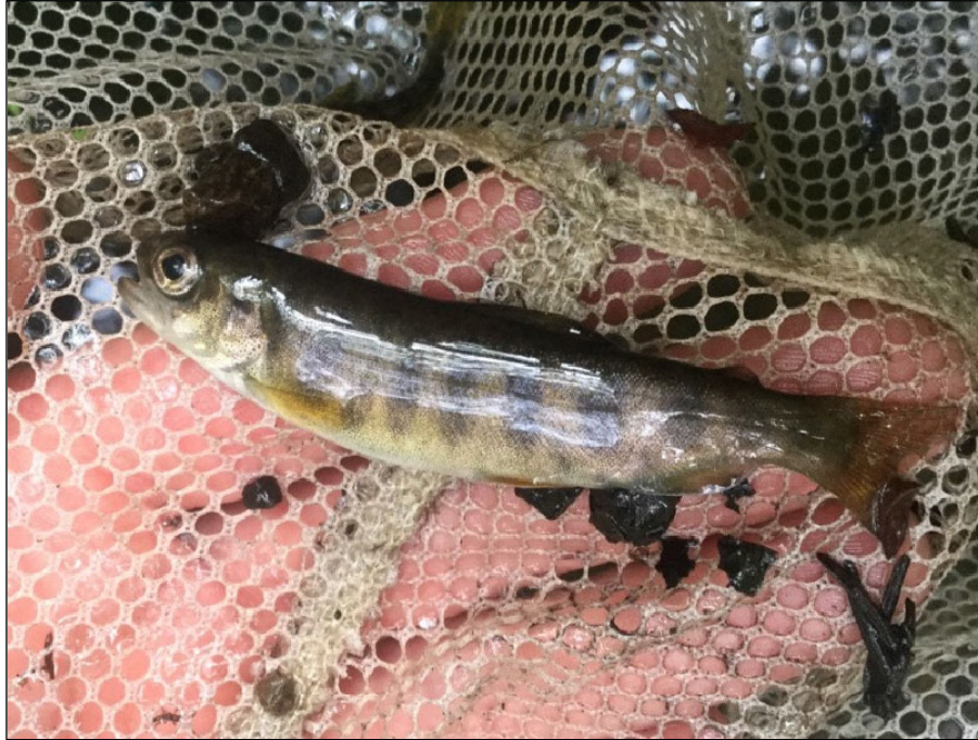
Figure 1.—Juvenile coho salmon captured at waypoint 606.